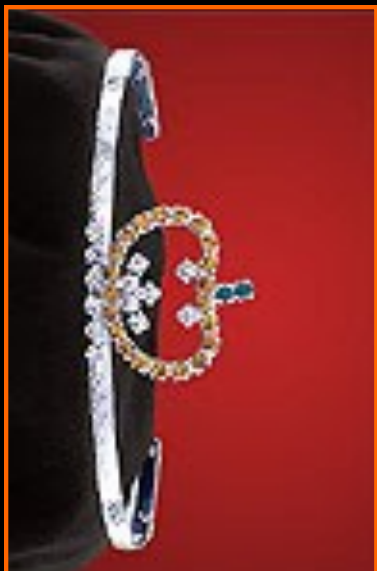
Every girl receives a rhinestone Participation tiara just for entering