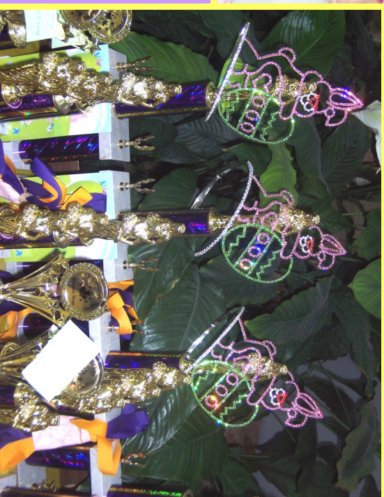
Just some of the trophies