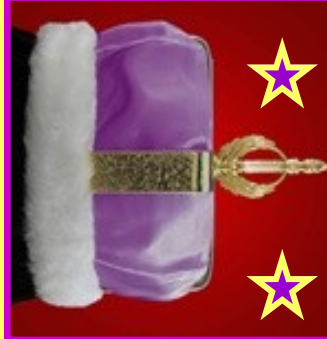
Some of the prizes for the Easter Pageant