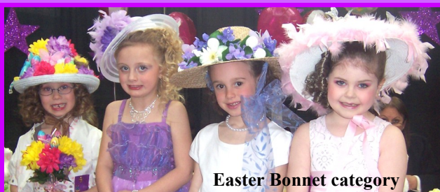
Easter Bonnet category

In each age division Girls 4-6, 7-9, 10-12, 13+ there will be a winner who will receive a Large music trophy, gold embossed banner, Tiara for girls Medal for boys, we will also present 4 additional runner-ups trophies and because we enjoy your talent and appreciate your time to entertain us -anyone else will be presented a participation medal. You are all Winners!!!!