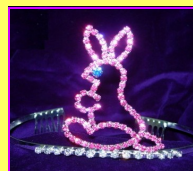
Fun Photo Tiara

At this pageant 28 trophies, 24 rhinestone themed tiaras, 20+ participation rhinestone tiaras & hundreds of dollars of entry fees to the International Grand Finals as prizes!!!